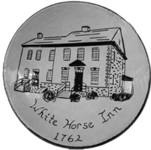
Redware plate approximately 7" in diameter.

The White Horse Inn, the third in the series of commemorative redware plates created by potter Denise Wilz, is ready to order. There is also a limited quantity of plate #1 Mouns Jones House and plate #2 Bridge Keeper's House.