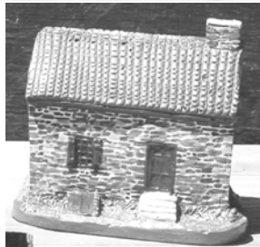
Bridge Keeper's approximately 4"x2½" Price $35

Please use the order form in this newsletter