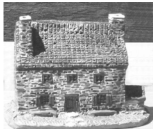
Mouns Jones approximately 4½"x3" Price $35