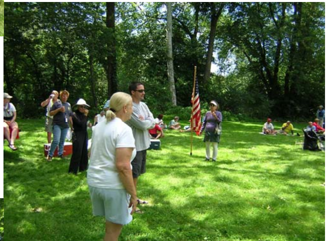
A relaxing lunch on the green →