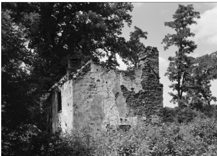
Mouns Jones House pre restoration 1958. See this image and many more by visiting the online archive. A link to the archive can be found on the Trust's website www.historicpreservationtrust.org

Suppliers: Wal-Mart, Kings IGA, Redners, Giant, and Sweet Street