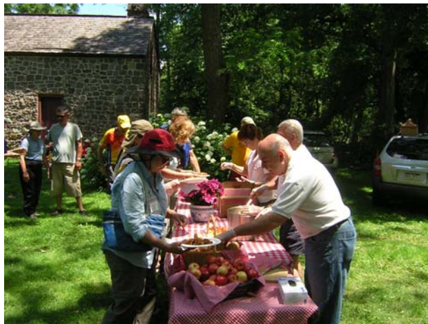
← Volunteers serving hungry sojourners