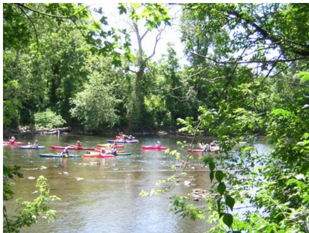
← Sojourners leaving Morlatton